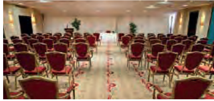
All meeting rooms are flooded with natural light.