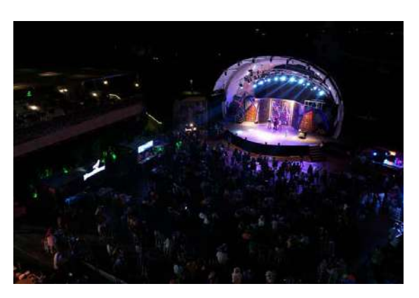
Rixos Premium Belek is a great place to relax with friends and family. Fans of outdoor activities will appreciate a wide range of entertainment programs, events and theme parties.