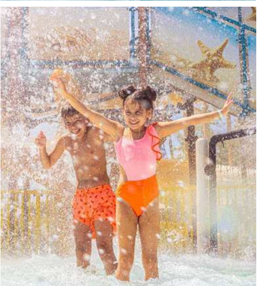
Rixos Premium Belek & The Land of Legends reserves the right to make changings on the concept without informing the 3<sup>rd</sup> individual/corporations.