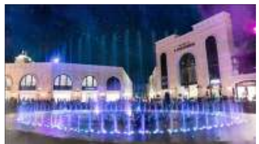
Rixos\ Premium\ Belek\ \&\ The\ Land\ of\ Legends\ reserves\ the\ right\ to\ make\ changings\ on\ the\ concept\ without\ informing\ the\ 3^{rd}\ individual/corporations.