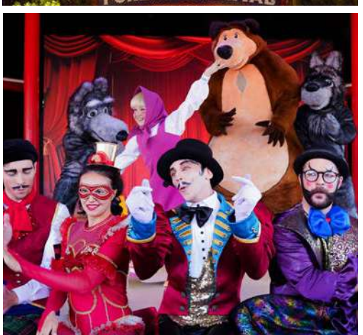
Rixos Premium Belek & The Land of Legends reserves the right to make changings on the concept without informing the 3^{rd} individual/corporations.