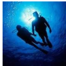
Diving Center PADI 5 Star